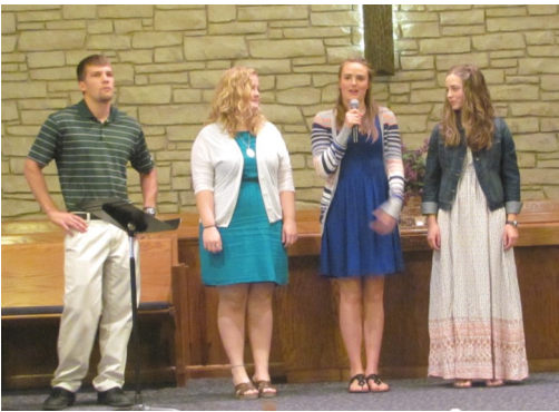
Graduate and Exchange Student Recognition