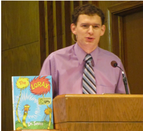
May Focus: Parables of Dr. Seuss