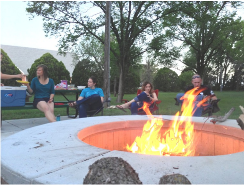
PCPF ~ Post College Pre Family gathering at the Tabor Church Park