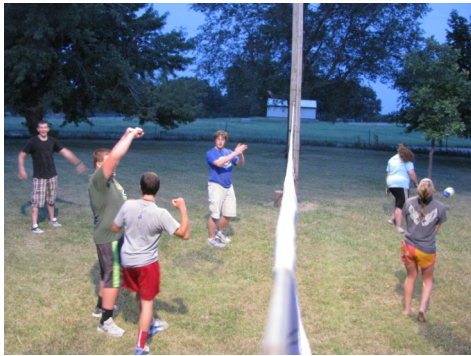
TMYF Fall Kickoff