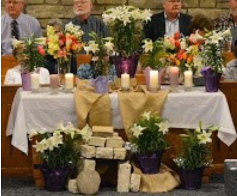
Jesus is Alive!!