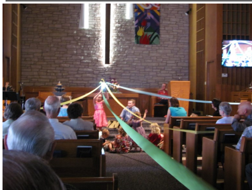
"Jesus is the Center of our Faith"