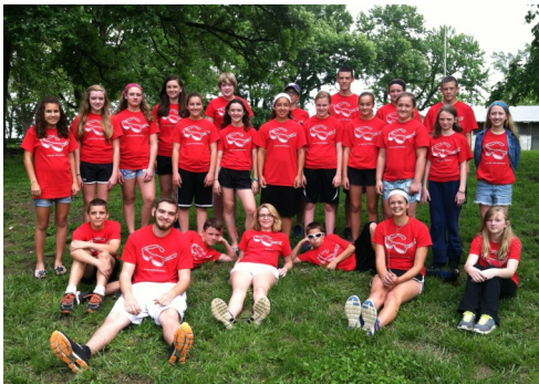
Junior High Camp WaShunga