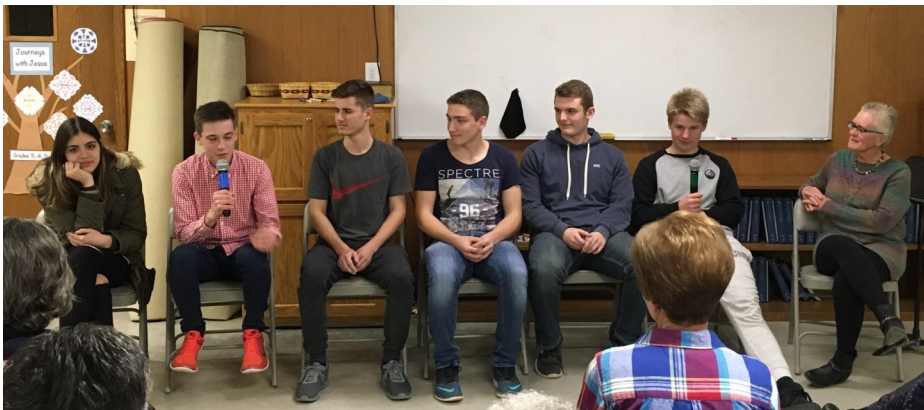
Foreign Exchange Students share at Tabor Mennonite Women meeting.