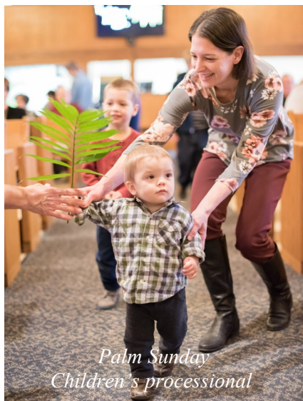
Palm Sunday Children's processional