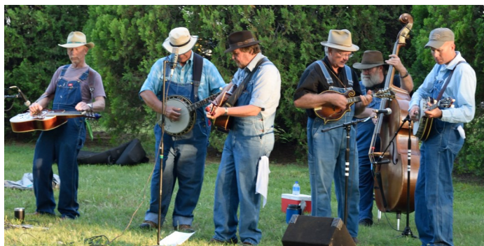
Smoky Valley Bluegrass Band