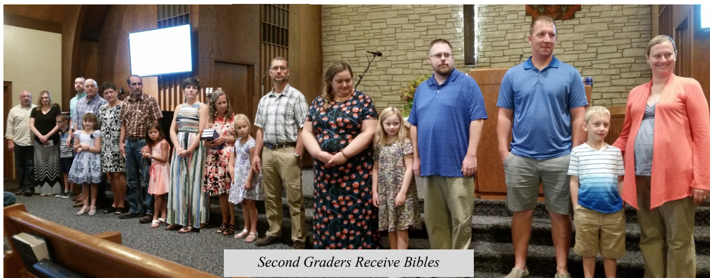
Second Graders Receive Bibles