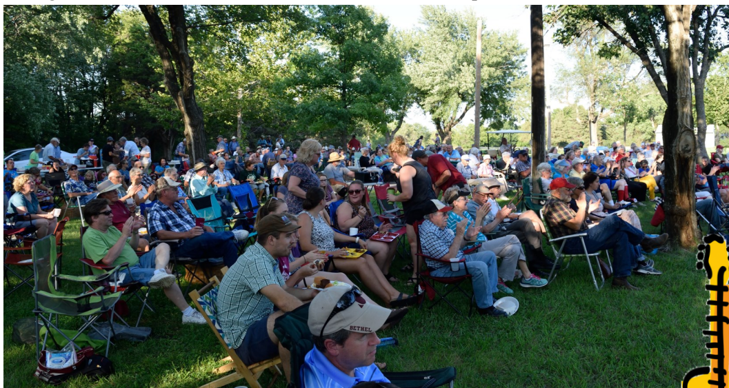
Loads of Fun and a Large Crowd