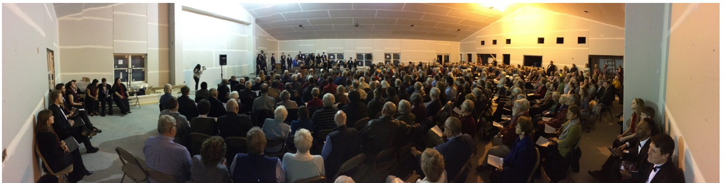
Joint concert by Hesston College Bel Canto Singers and Bethel College Concert Choir with Tabor Mennonite Church Adult Choir Tabor Mennonite Church, New Fellowship Hall ~ February 17, 2019