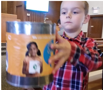
Coins for MCC Relief Sale