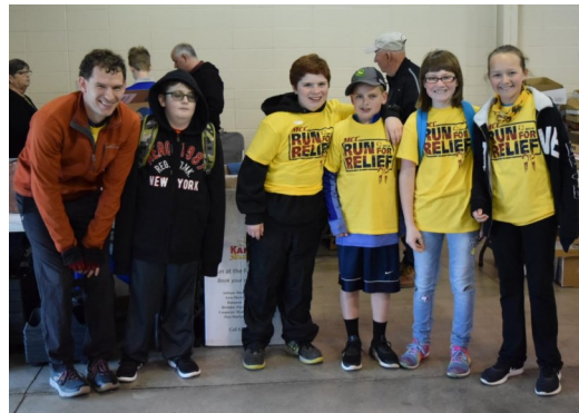
Kansas MCC Relief Sale Jr. High Run for Relief