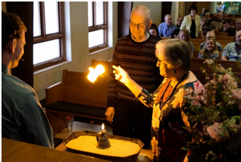
Witness to God's Peace