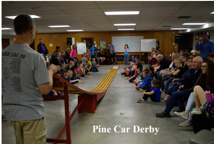
Pine Car Derby