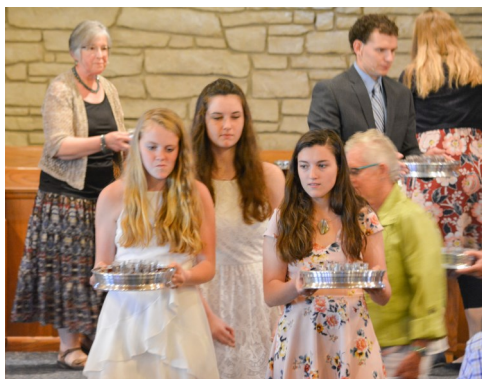
Newly Baptized Members Serving Communion