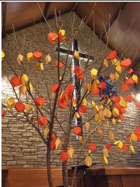
Thanksgiving for Healing