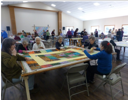
MCC Comforter Blitz in Hospitality Hall