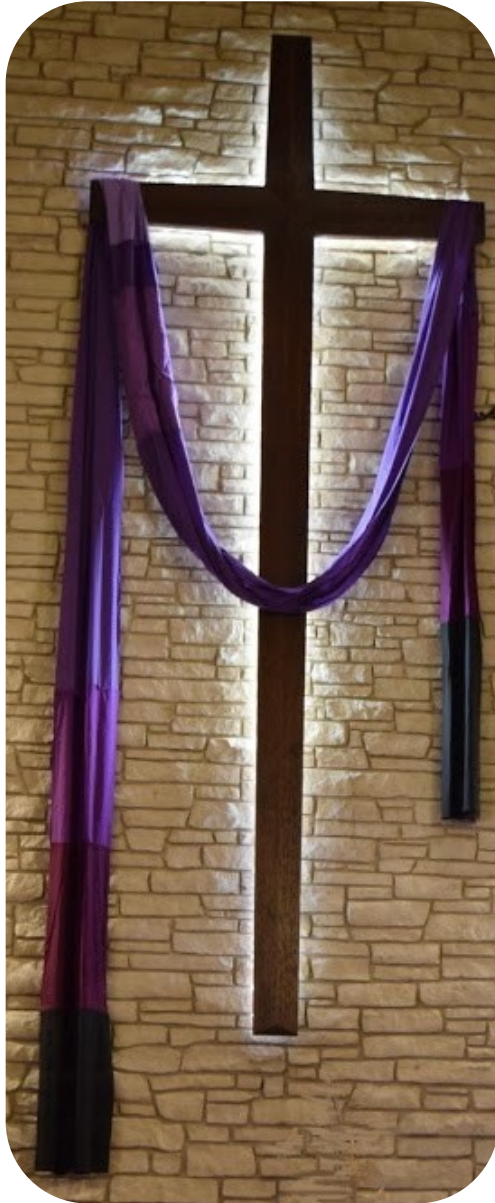
Tabor Mennonite Church Holy Week ~ April, 2020