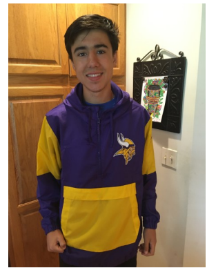
"Being an Exchange Student"

Leaving home is not easy, Starting a new life is not easy, The beginning is not easy.