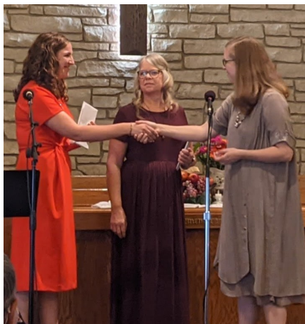
Welcoming New Members July 18, 2021