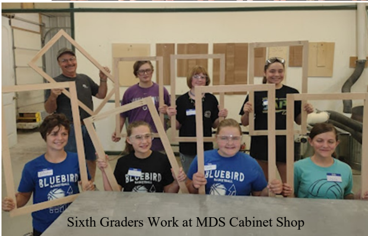
Sixth Graders Work at MDS Cabinet Shop