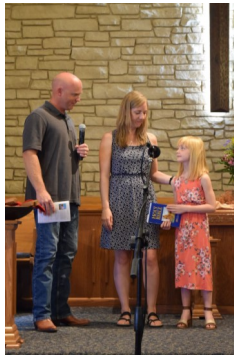
Second Graders Receive Bibles and Display of 'First Bibles' August 8